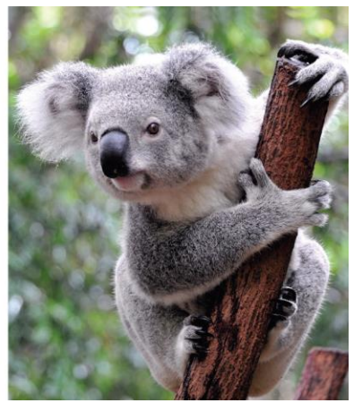
HIGHLIGHTS... Cairns, Great Barrier Reef, Sydney, Sydney Opera House, Christchurch, Mount Cook National Park, Queenstown, Milford Sound, Arrowtown

Day 1 – 2: October 20 – 21, 2014 Depart From Home Today you board your flight and begin the adventure of a lifetime. Crossing the International Dateline, you skip a day ahead.